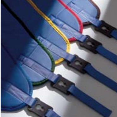
ArjoHuntleigh slings are color-coded to clearly indicate sizes.

Patient interface solutions are the key to optimizing care for individuals. The comprehensive range of Maxi Sky 600 accessories gives facilities flexibility to provide ideal solutions for different client requirements and to respond to their changing needs.