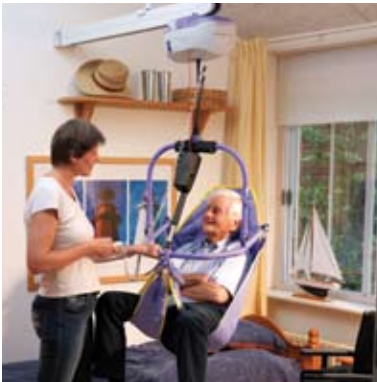
A 4-point Powered DPS spreader bar is available.

A complete range of ArjoHuntleigh loop and clip slings covers the needs of all healthcare facilities. Clip slings include standard padded and unpadded slings, special purpose slings for toileting, mesh slings for bathing and showering, and solutions for single and double amputees. The broad spectrum of sizes and sling types means that the ceiling lift can always be used with a sling that is optimized for the client's comfort and safety.