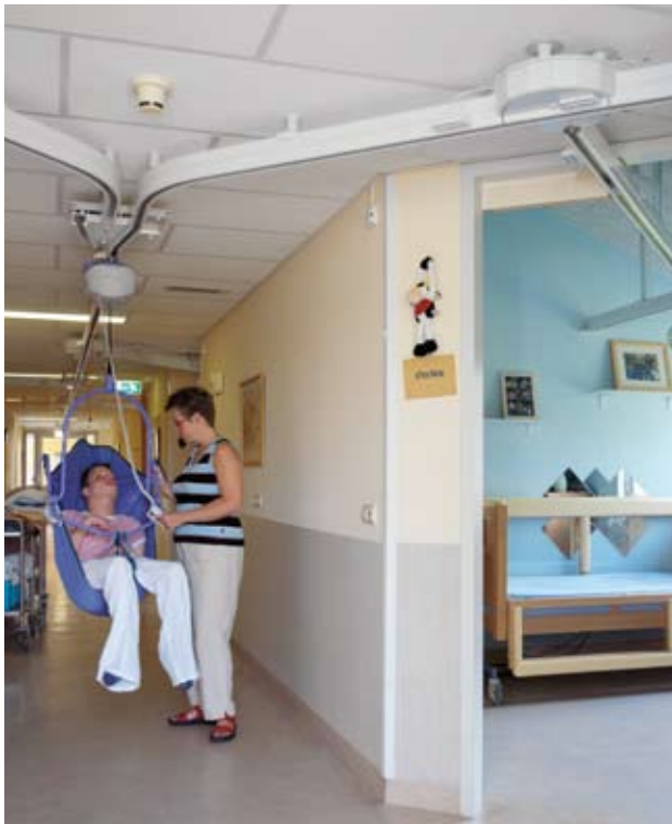
The exchanger and turntable enable a variety of different track solutions.

The exchanger is powered by the lift cassette of Maxi Sky 600 to facilitate track switching. This solution means no extra power supply needs to be installed.