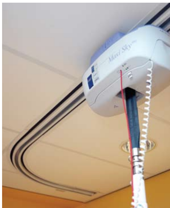
The track can be partially concealed in a suspended ceiling to provide a discreet solution.