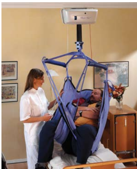
There is a full range of Maxi Sky ceiling lifts which include a portable lift, Maxi Sky 440 , with a safe working load of 440 lbs (200 kg) and, pictured here, Maxi Sky 1000 , which is designed to handle bariatric clients, and has a safe working load of 1000 lbs (455 kg).