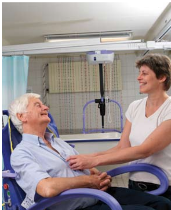
When full-room coverage is required, the X-Y (traverse) system is an ideal choice. With the unique traverse action, the track moves easily, with no risk of jamming.