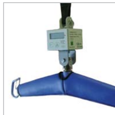
Class 3-approved scale, used here on a 2-point spreader bar.