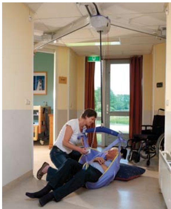
If a client has fallen, the long lifting strap (7 1/2 feet) makes it easy and safe to perform a lift from the floor.