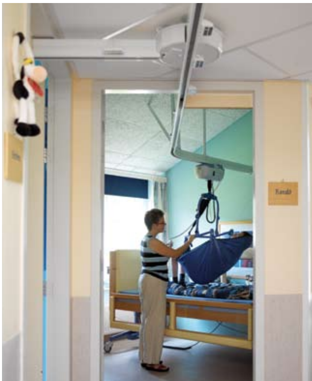
A turntable provides a choice of direction outside the client's room.

Two, three or four tracks can be connected at various angles to the turntable, which is also powered by Maxi Sky 600 .