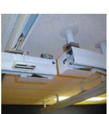
The gate, powered by Maxi Sky 600, is a smooth way to combine a fixed track and an X-Y (traverse) system.