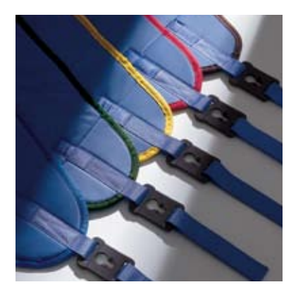
ArjoHuntleigh slings are color-coded to clearly indicate sizes.