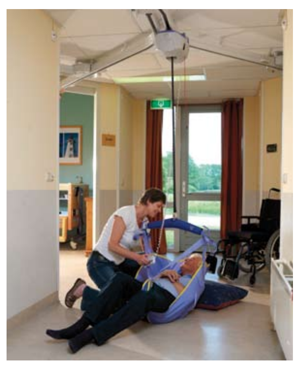
If a client has fallen, the long lifting strap (7 1/2 feet) makes it easy and safe to perform a lift from the floor.