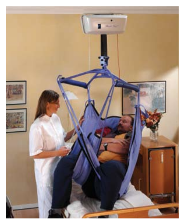
There is a full range of Maxi Sky ceiling lifts which include a portable lift, Maxi Sky <sup>440</sup>, with a safe working load of 440 lbs (200 kg) and, pictured here, Maxi Sky <sup>1000</sup>, which is designed to handle bariatric clients, and has a safe working load of 1000 lbs (455 kg).