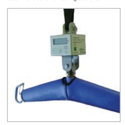
Class 3-approved scale, used here on a 2-point spreader bar.