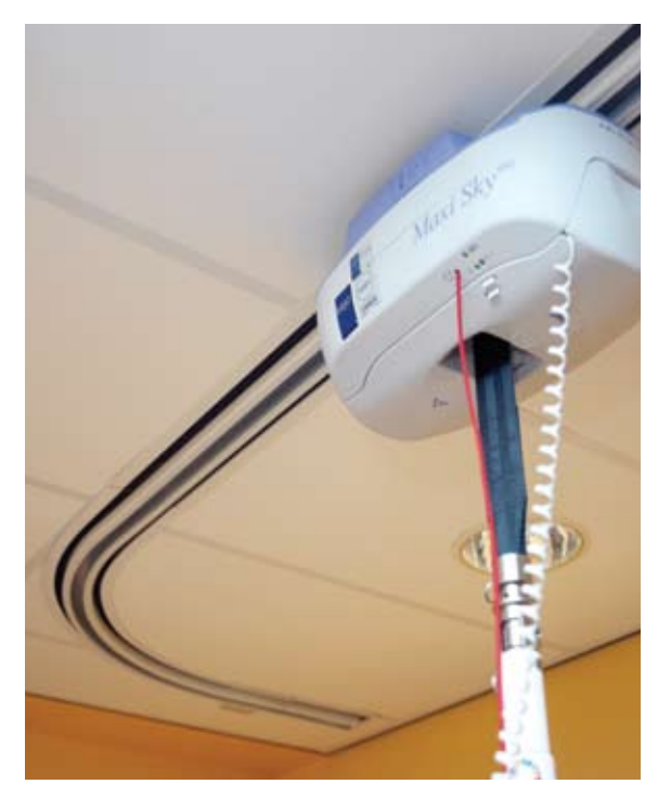
The track can be partially concealed in a suspended ceiling to provide a discreet solution.